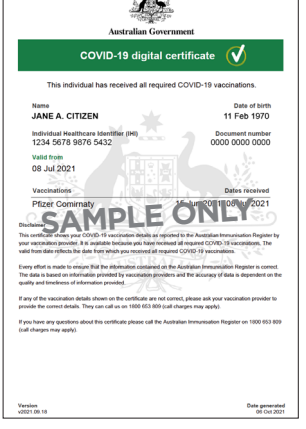
account through myGov)