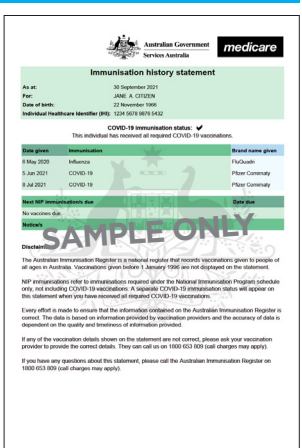
(shown digitally) (shown as a printed copy)