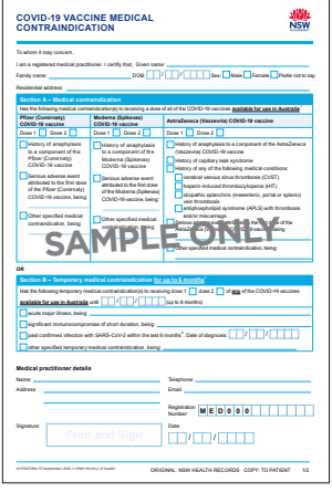
(shown as a printed copy, Must be signed by a doctor)