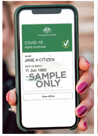
AMPLE UI 2021