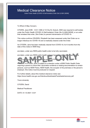
(shown as a digtal pdf)