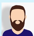
President or Chairperson